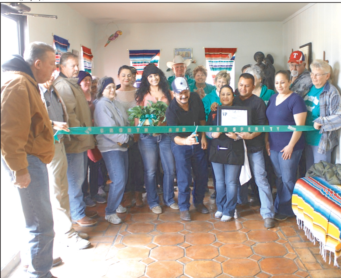
Ribbon Cutting! Members of Robert Lee's Vision with a Purpose recently assisted with a Ribbon Cutting celebration at Rangel's Restaurant in Robert Lee.

Requirements for filing for school board are that you must have lived in the state for one year and six months in the school district prior to filing, be at least 18 years of age, and be a registered voter at the time of election.