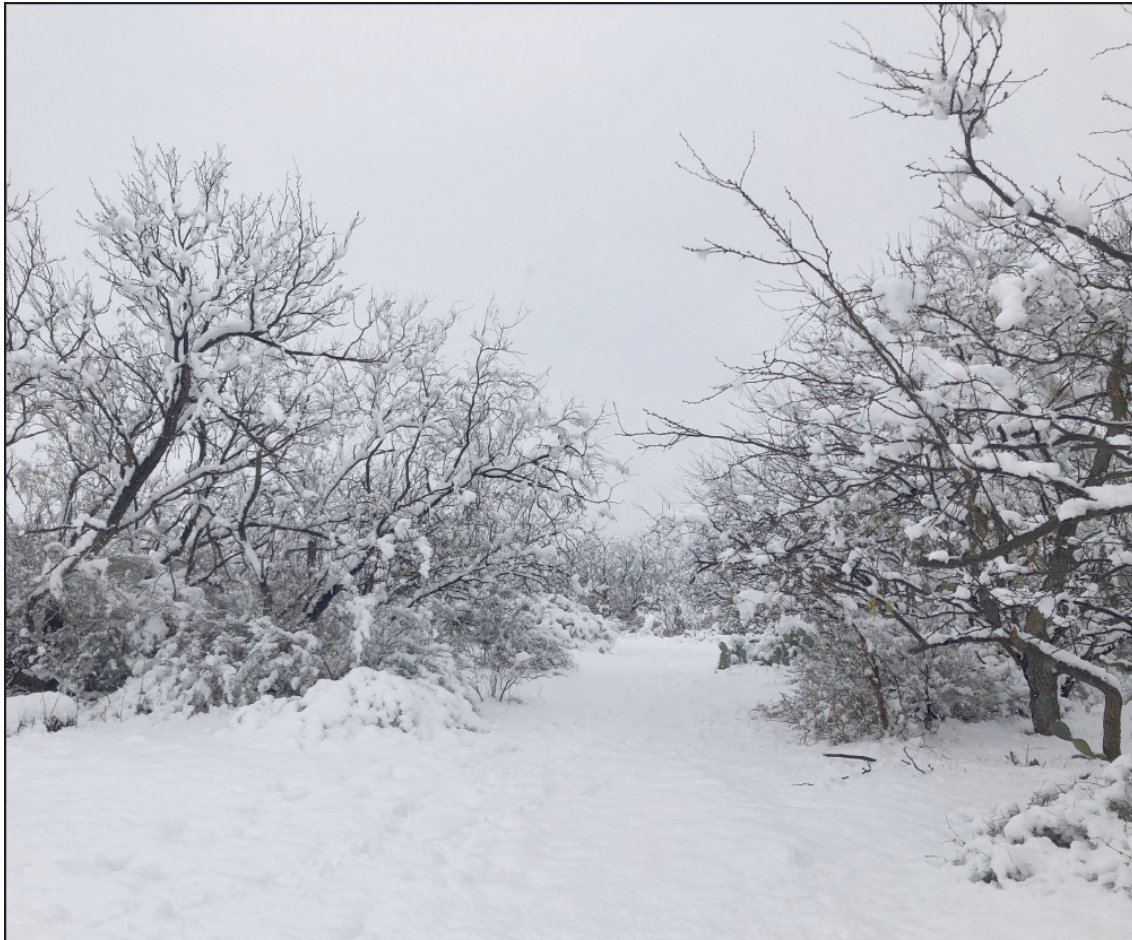
Snow! Snow! And More Snow!!!! After the nice snowfall on New Year's Eve, Coke County citizens woke up to even more snow Sunday morning, January 10, 2021. By the time it ended that evening, some areas in Coke County had received over 8 inches of heavy, wet snow. With the unusual weather, we are once again including pics of kids of all sizes enjoying the fluffy white stuff!

If you would like to make a monetary donation to help support these hardworking kids during these uncertain times, donations may be mailed to: Coke County Livestock Association, PO Box 555, Robert Lee, Texas 76945.