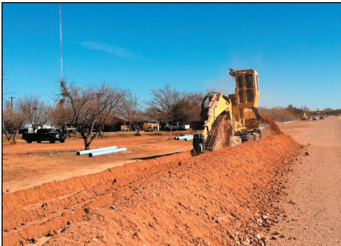
It's Begun! The trench for the water pipeline is under construction. Digging began Tuesday, with the machine and its operator being donated by Vermeer.