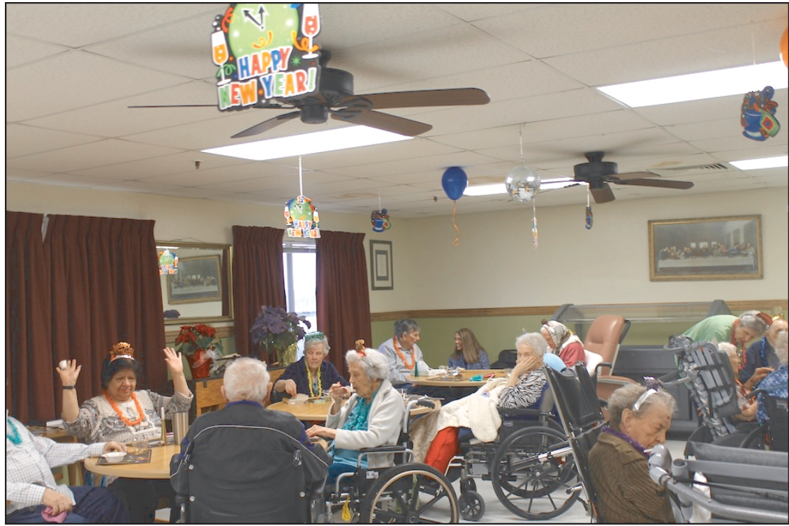
Happy New Year! Residents, staff, family and friends enjoyed the New Year's party at Bronte Health & Rehab Center.

Per Year in Coke County ... $30.00 Per Year Elsewhere in Texas ... $35.00 Per Year Outside of Texas ... $37.00