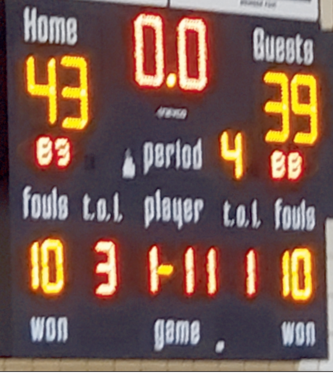
Double OT! The Robert Lee High School Lady Steers recently defeated the Irion County Lady Hornets 43 - 39 in a hard fought game that went in to double overtime.