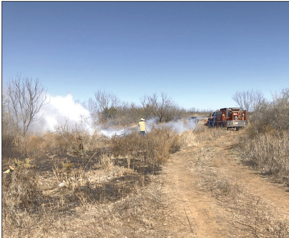
Fires West of Robert Lee! The Coke County Sheriff's Office, Robert Lee Volunteer Fire Department and Texas Parks and Wildlife Officers responded to several brush pile fires west of Robert Lee near Paint Creek Road and Harmon Lane on Saturday, January 18, 2020. Coke County is, and was, under a burn ban. The piles had been left unattended after being lit and one of the piles had already set the surrounding pastureland on fire.