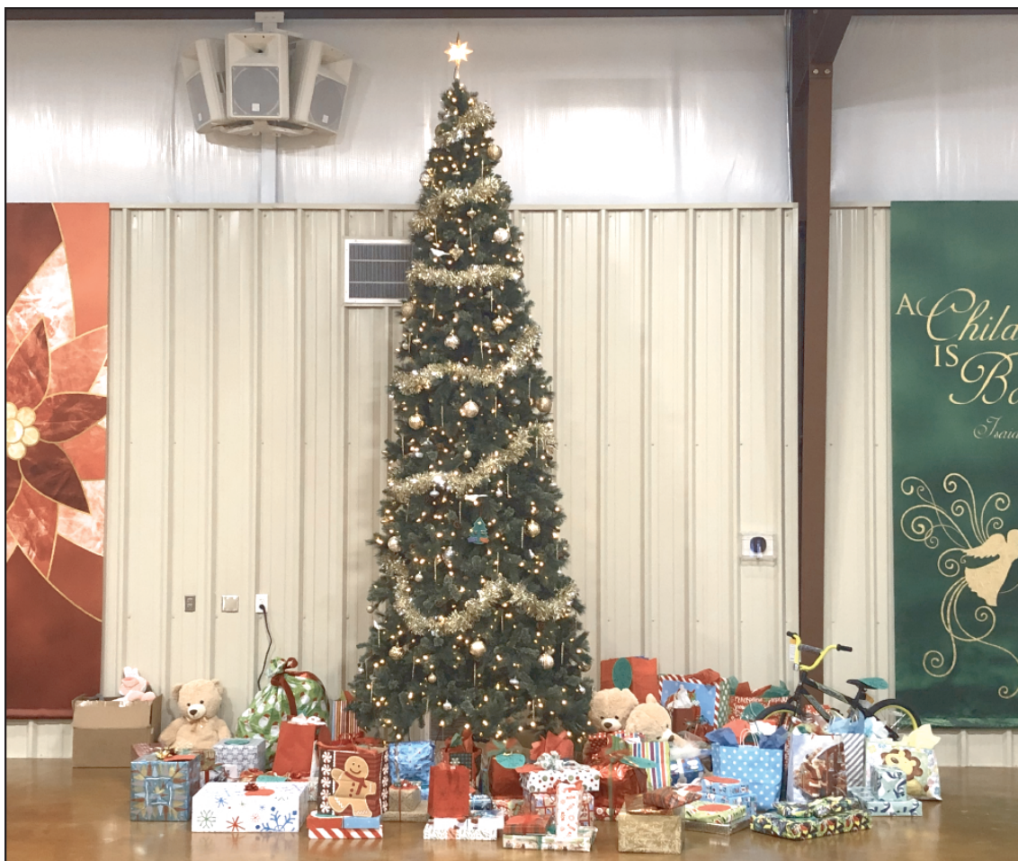
Angel Tree! With the generous outpouring of support from Robert Lee, the Angel Tree was a success during the 2018 Christmas season. Many gifts were provided to children and senior citizens in the Robert Lee area and were beautifully displayed at the First United Methodist Church in Robert Lee.

Sheriffs Info Report - 5; Civil Matters - 3; Welfare Check - 3; Criminal Mischief - 2; Emergency Detention - 2; Domestic Disturbance; Recovered Stolen Vehicle; Theft - 3; Assault Family Violence; Driving While Intoxicated; Burglary of a Habitation - 3; Homicide; Public Service (includes funerals, court, motorist assist, alarm calls, etc) - 234; Civil Process - 2; Prisoner Transport (including arrest and to and from court) - 4; Emergency Detention Transport - 2; Warrants Served - 0; Livestock Calls - 16; Accidents - 6; Accident Assist - 2; Traffic Stops - 14; Traffic Stops resulting in citations - 5. Total inmates in Runnels County Jail as of Monday, November 12, 2018: Males - 1 (awaiting transport to TDCJ); Females - 1.