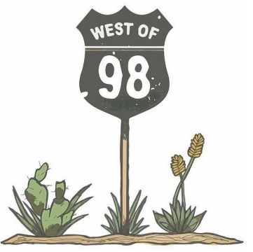
2020: A Year of Reading

By James M. Decker In March 2020, as our community, state, and nation halted many "normal" activities to limit the spread of the coronavirus, many of us found ourselves with more free time I vowed to than usual. prioritize that time for more reading. As I wrote, I have always loved to read, but the nature of adult life can make it hard to prioritize reading. It is more difficult when your daily duties require heavy reading when you spend too much time reading screens and documents as a necessity, the unfortunate human inclination is to avoid reading when you don't *have* to do it.