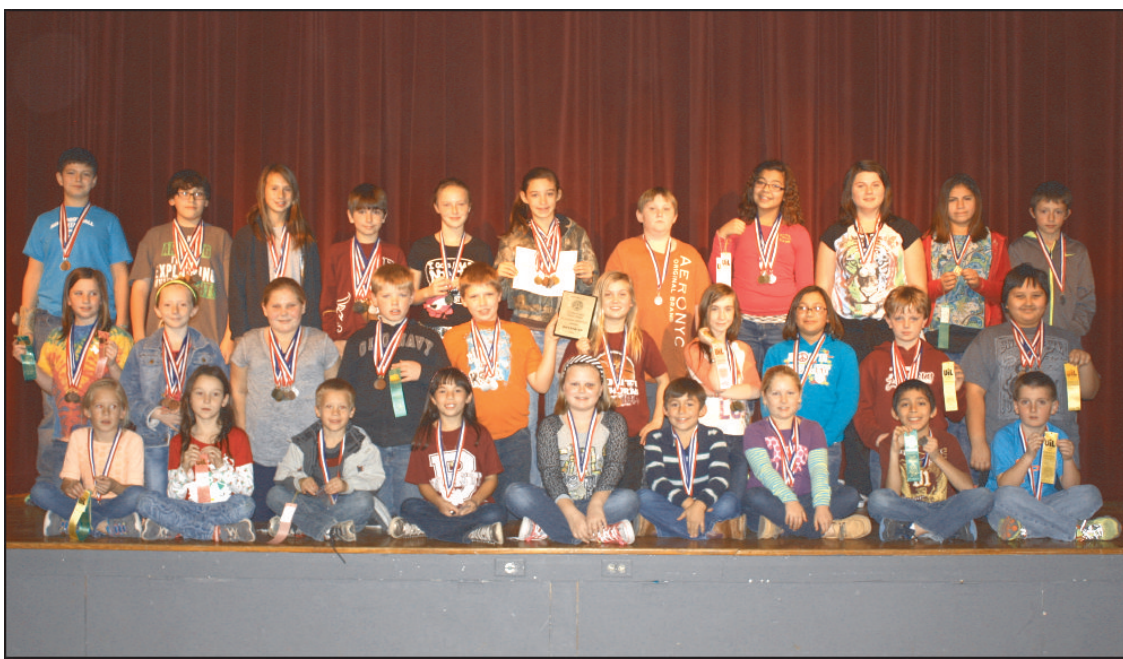
Bronte Elementary UIL! These Bronte Elementary students received awards for their placings at the district UIL competition.