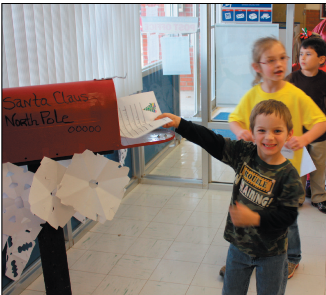
Dear Santa! This young man knows by now if Santa got his letter. The Bronte Kindergarten class made a special trip to the Post Office in Bronte to deposit their Christmas list in Santa's personal box.

The official Tags can be obtained at no charge to the producer at the Texas AgriLife Extension Office inside the Coke County Courthouse Monday - Thursday 8:00-5:00 and Friday 8:00-1:00. The tags are also available to producers at livestock auction barns; however the producer will have to pay a tagging fee if they chose to use this option.