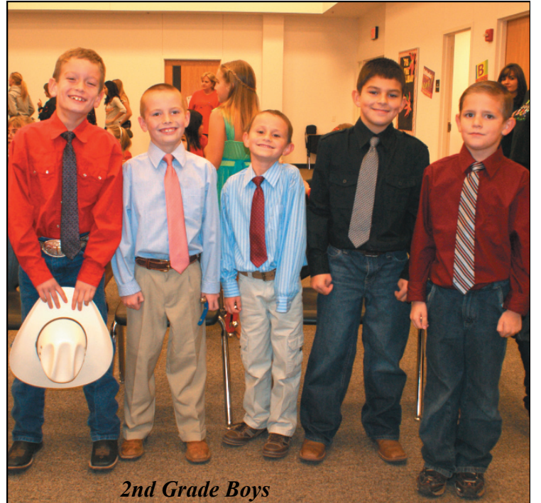
2nd Grade Boys