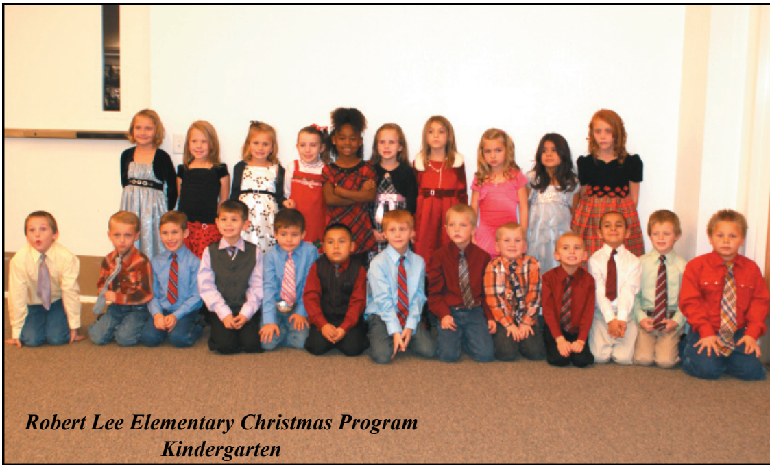
Robert Lee Elementary Christmas Program Kindergarten