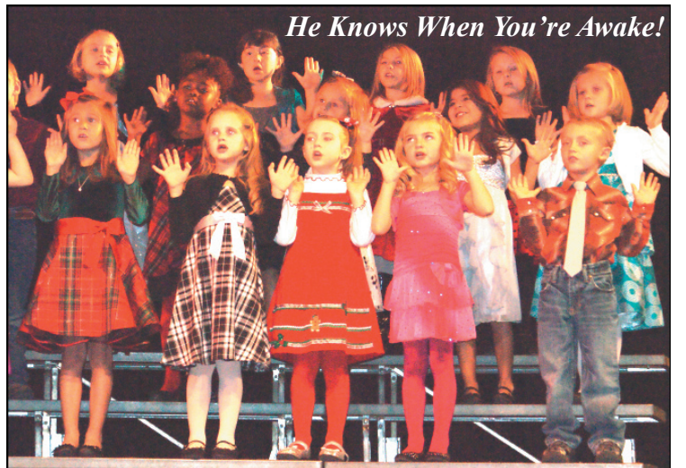
He Knows When You're Awake!

View our full color edition at Observer/Enterprise.com