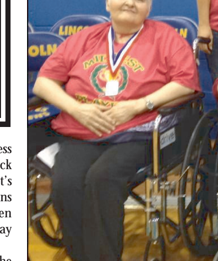
BHRC Field Trip! Residents of Bronte Health and Rehab Center enjoyed a trip to watch the Midwest Play Day events at Lincoln Middle School in San Angelo recently.

This third year, God's Spirit touched me to invite more of God's people to share in our All Saint's Day Prayer Walk. Therefore, I am sending this same invitation to every Newspaper and Christian church email I can find, local and afar, throughout America. encourage churches to tell their congregations of this prayer walk