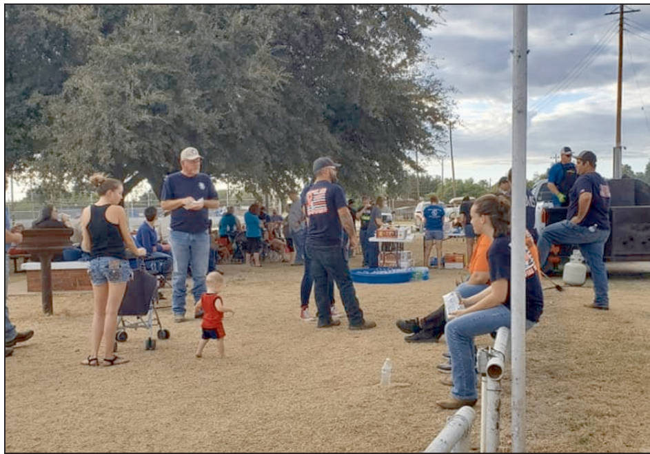
National Night Out! Robert Lee Community Watch hosted the 2nd annual National Night Out on Tuesday, October 1, 2019, at the Robert Lee Park. There was a great turnout and everyone in attendance enjoyed the evening and beautiful weather. The group appreciates the efforts of those that helped and participated, as well as the Sheriff's Office, County Constable, local DPS, Game Warden, Robert Lee Volunteer Fire Department and West Coke County EMS. Robert Lee is blessed to have such amazing public servants in the community.