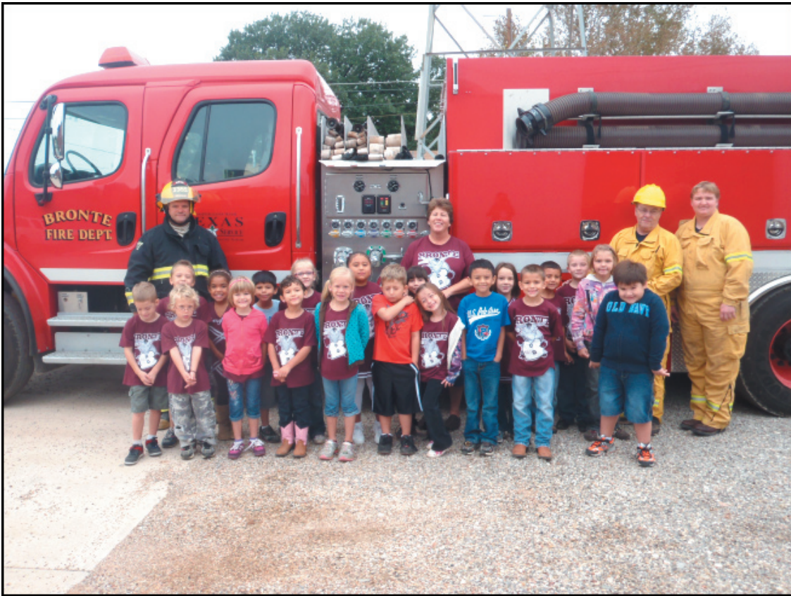
First Grade Field Trip! On Friday, October 5, Bronte's first graders went on a field trip to the Bronte Volunteer Fire Station as part of Fire Safety Week. The children interviewed the firefighters, looked at their tools, squirted the water hose, and rode back to school on top of Big Red.