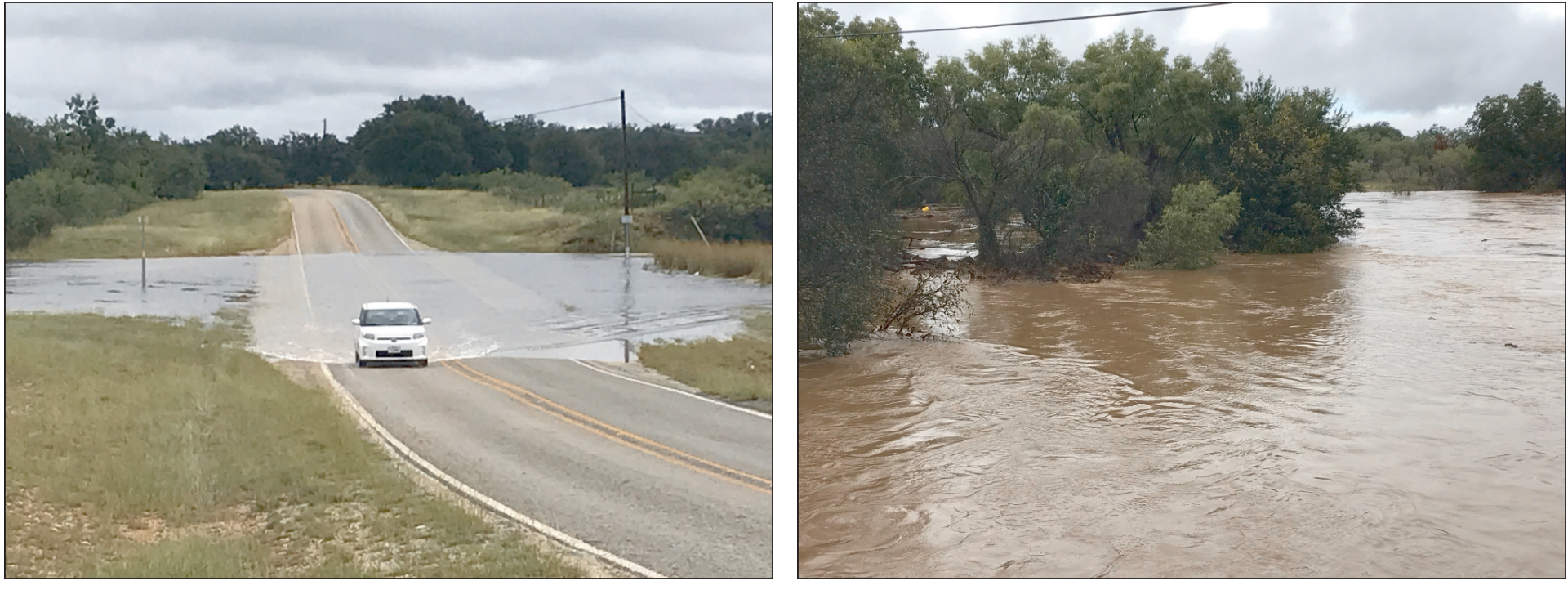
Lots of Water! Coke County experienced heavy rainfall in the overnight hours of Monday, October 8, 2018, and early morning, Tuesday, October 9, 2018. Some reports say that between 4 inches and 6 inches of rain had fallen over the watershed for Oak Creek Lake. Lake Dam Road (above left photo) had water over the road due to Oak Creek Lake going over the spillway. The above right photo shows the rise in water from a bridge west of Blackwell on FM 1170.