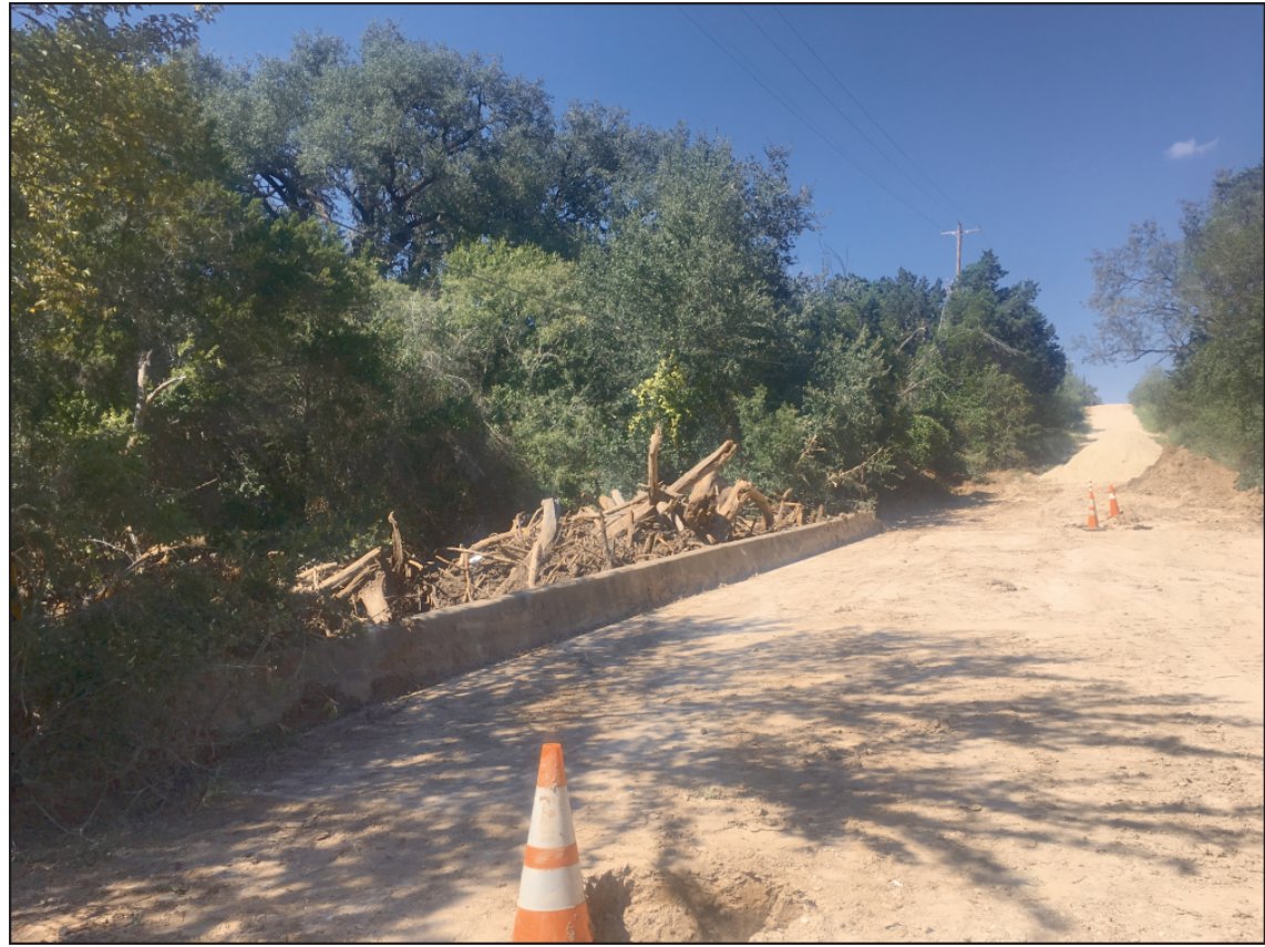
Damage! Mid-September rains led to this bridge on Ross Road in northern Coke County being damaged and closed. Coke County Precinct 2 had been working on it prior to these most recent heavy rains.

Boneless wing chunks, mashed potatoes, gravy, green beans, hot roll, milk