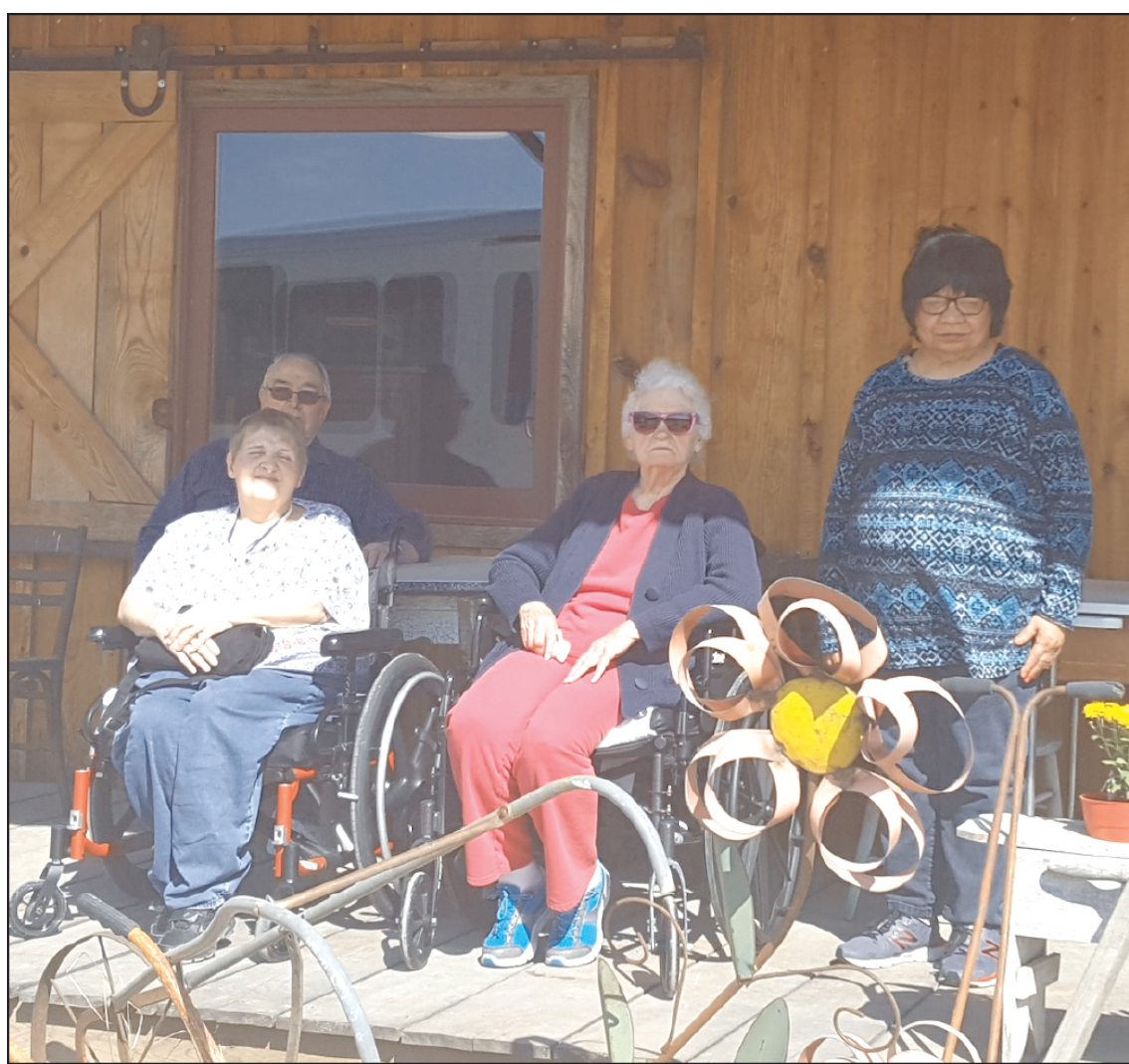
Excursion! A few residents from Bronte Health and Rehab Center were treated to some goodies recently at Frozen in Time, a restaurant and antique shop, located in Miles.

– Oct. 19, 8:30 am - 1 pm, Tom Green 4-H Center, 3168 N.