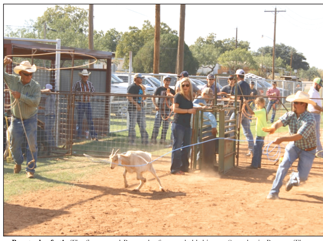
Bronteoberfest! The first annual Bronteoberfest was held this past Saturday in Bronte. The event was a resounding success with activities spread from downtown Bronte (top photo) to the park. Among these were vendors, cook-offs, beer tasting, a goat roping (bottom photo) and a dance that evening. Next year's event is already in the works and will be held October 15, 2016.