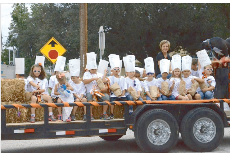
Homecoming Parade! Although the Robert Lee Homecoming game was cancelled due to the storms which rolled through Coke County October 10, 2014, the parade went off without a hitch. Winning floats included (left photos, from top): 1st Place - Robert Lee 6th Grade Class; 2nd Place - Robert Lee Freshman Class; 3rd Place - Robert Lee Care Center; and 4th Place - 1st Grade Class.