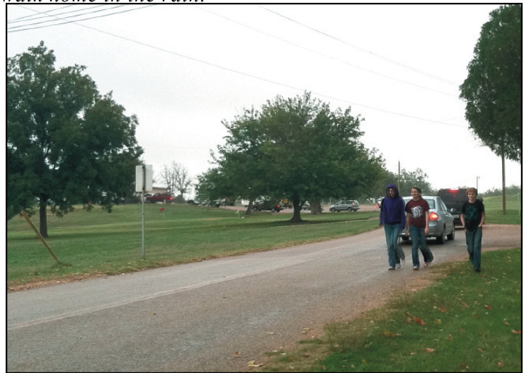
Students dismissed from the Community Center (below), walk home in the rain.