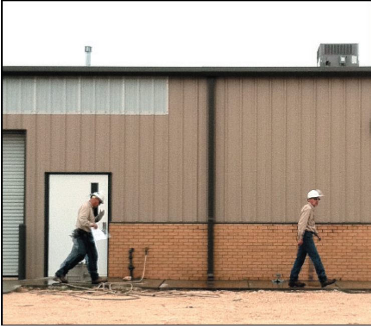
Bomb Threat! Representatives of AEP (above) make sure all power is disconnected at the ag building prior to the sweep Monday morning.