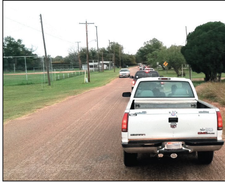
Anxious parents wait in their cars in the long line on Oliver Street (Park Road) that stretched all the way up the hill past the Senior Citizens Center.

Whether this was a student trying to get out of a test, a disgruntled parent or former employee, or a threat from an Islamic Jihadist (I know, I can't believe I said that