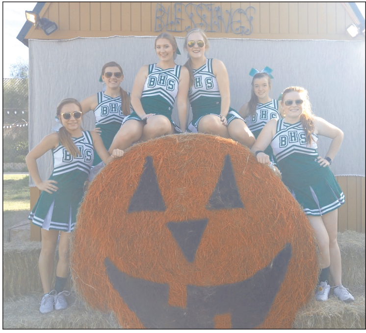
Blackwell Varsity Cheerleaders find the Great Pumpkin!