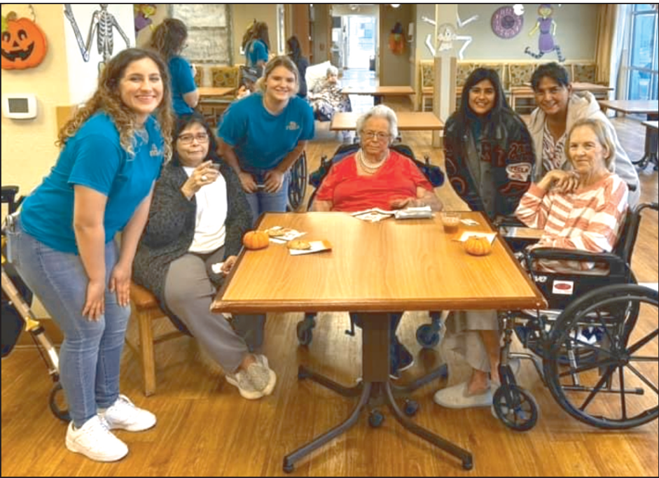
Fall Fun! Part of the Robert Lee FCCLA chapter recently visited residents at Robert Lee Care Center. Everyone enjoyed cookies, peach tea punch, and decorating mini pumpkins for the rooms of the residents.