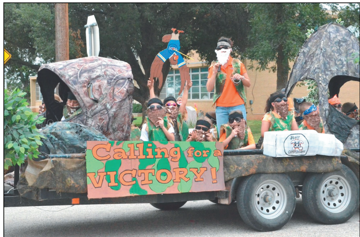
2nd Place Float • Robert Lee 2nd Grade