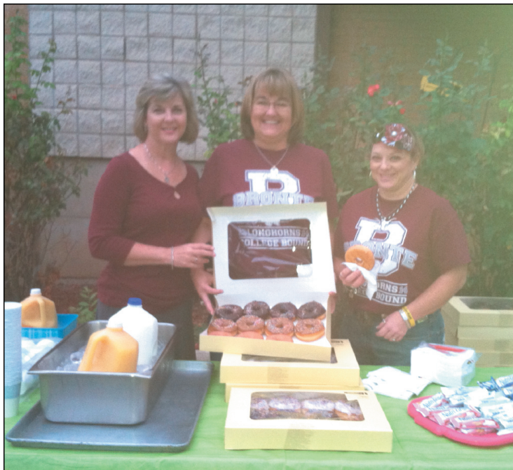
Pastries for Parents! Bronte Elementary School invited all parents to drop off their children at school last Friday and enjoy pastries before beginning their day. Pastries were provided by the Longhorn Academic Boosters.

Although the Horns came out on the losing end of another game this year, they are still working to improve their skills and focusing on their next opponent. This week, the Horns are back at home as they take on the Irion County Hornets at 7:30 pm tonight.