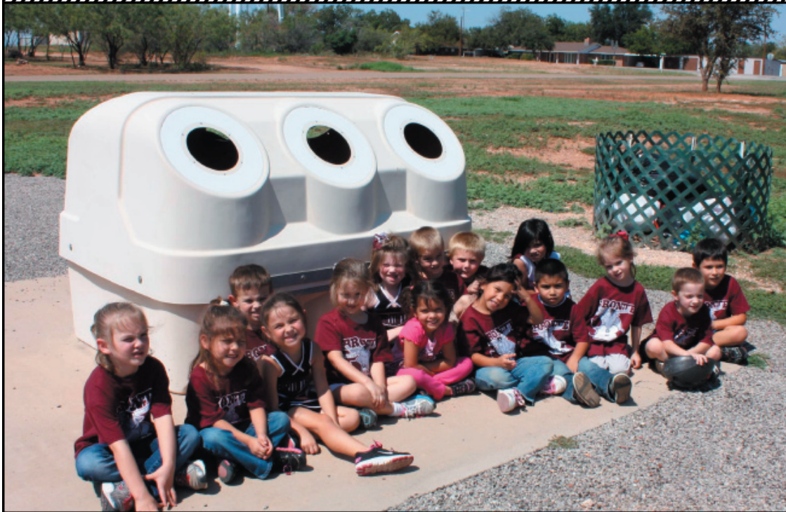
Kindergarten Class Learns to Recycle! The Bronte Kindergarten Class (above and right photo) visits the Bronte Recycling Area where they recycle plastic bottles.