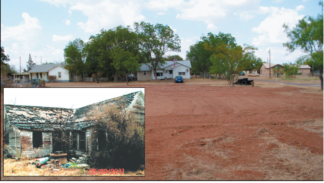
Community Beautification! Following a legal process by the City of Robert Lee, the above photos are the before and after shot of 1521 Chadbourne Street. This home and two others have been removed. The next scheduled open meeting of the Robert Lee Board of Adjustments and Appeals is set for 7 pm Tuesday, October 25, at Robert Lee City Hall. The purpose of this meeting is to consider other properties in Robert Lee for repair, removal or demolition.

If you have pictures or stories of last season's hunting and/or fishing sucnoon on Saturday, October cesses or pictures of this