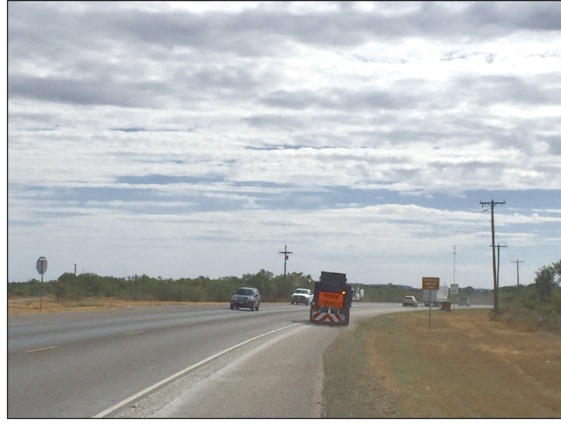
Highway Safety! TxDOT crews were out in force Monday, October 5, 2015, adding safety features in the four miles of US Highway 277 just north of Bronte. They first brought in a radar trailer a couple of weeks ago and this week, they cut in rumble strips. The strips run just outside of the white lines and down the center of the highway.

lic school purposes of a residence homestead. The proamendment would increase this exemption to $25,000, starting in the tax year beginning January 1, 2015. In order to reflect the increased exemption on the homestead of a person 65 years of age or older or a disabled person, the proposed amendment would provide a reduction to the current limitation on the total amount of ad valorem taxes. The proposed amendment would protect school districts from all or part of the revenue loss by authorizing an appropriation of funds according to formulas set by the legislature. In addition, the proposed amendment would authorize the legislature to prohibit a political subdivision from reducing or repealing a homestead exemption adopted by the political subdivision. Finally, the proposed amendment would prohibit the imposition of a tax on the conveyance of real property, but would not prohibit the imposition of a business tax measured by business activity, a tax on the production of minerals, a tax on the issuance of title insurance, or a change in the rate of a tax in existence on January 1, 2016.