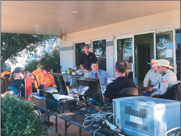
As each sector was cleared, the dogs, their handlers and flankers, would return to the Coke County Juvenile Justice facility to rest and to discuss and report any findings.