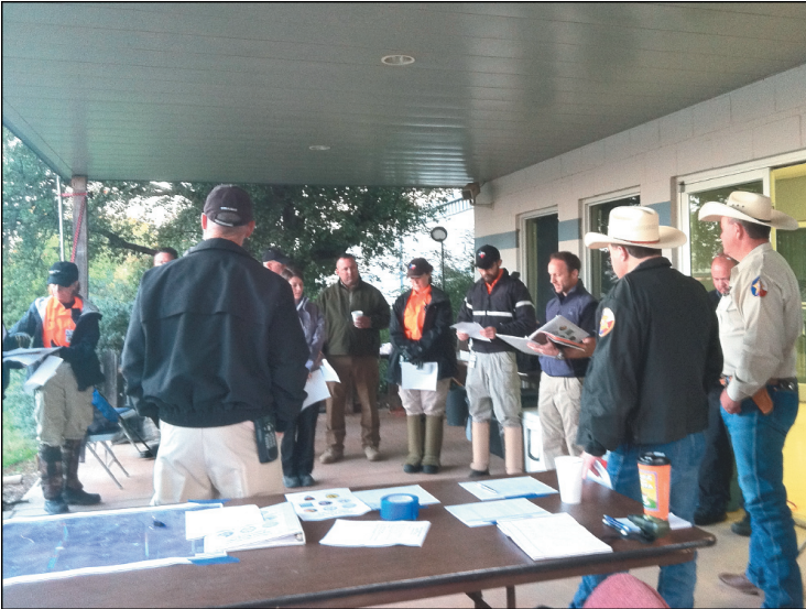
Everyone associated with Thursday's search gathers at the old Coke County Juvenile Justice facility for a morning briefing before heading out into the field.