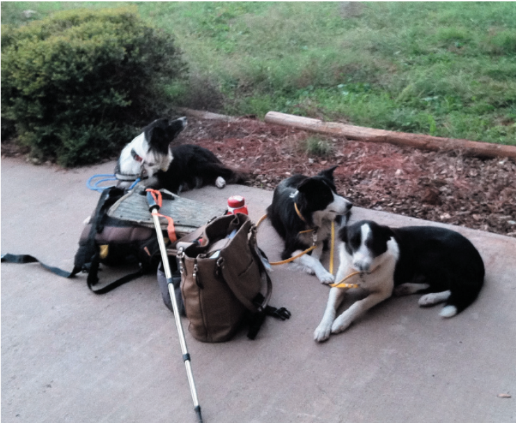
Not Just for Working Sheep! Border Collies are famous for their abilities to herd livestock, but who would have realized how wonderful they would be as HR dogs? These are three of the HR canines brought in for last Thursday's search. The other HR dogs used that day included a Doberman, a Standard Poodle, and what appeared to be a Husky cross.

For more information on TexSAR or to make a donation, visit their website at texasar.org .