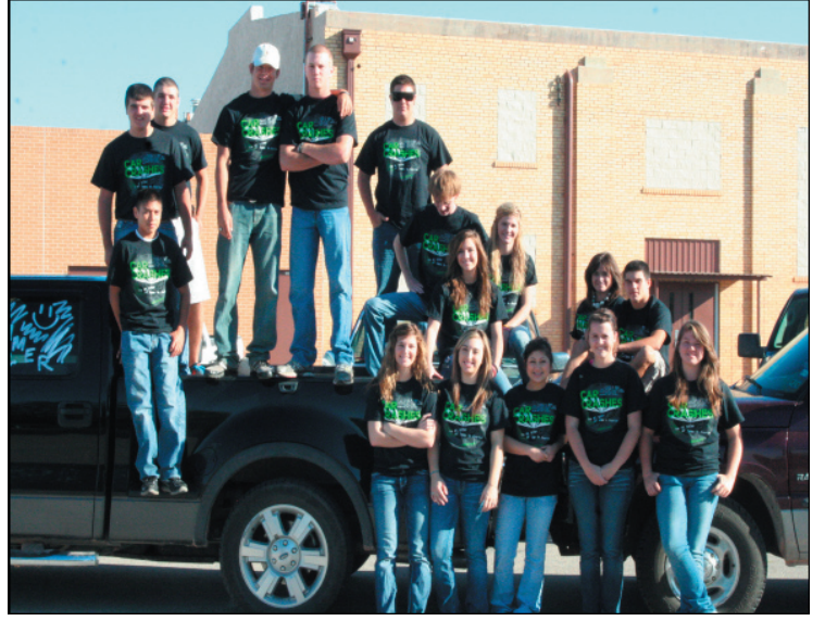
Teens in the Drivers Seat! Members of Teens In the Driver Seat are shown above. The program teaches safety and awareness to teen drivers, urging them not to text and drive and to stay focused on the road.

scored on a 12 yard run midway through the quarter. The Longhorns would respond as Baumann closed out the first half, scoring on a one yard plunge that gave the Horns a 28-7 lead at intermission.