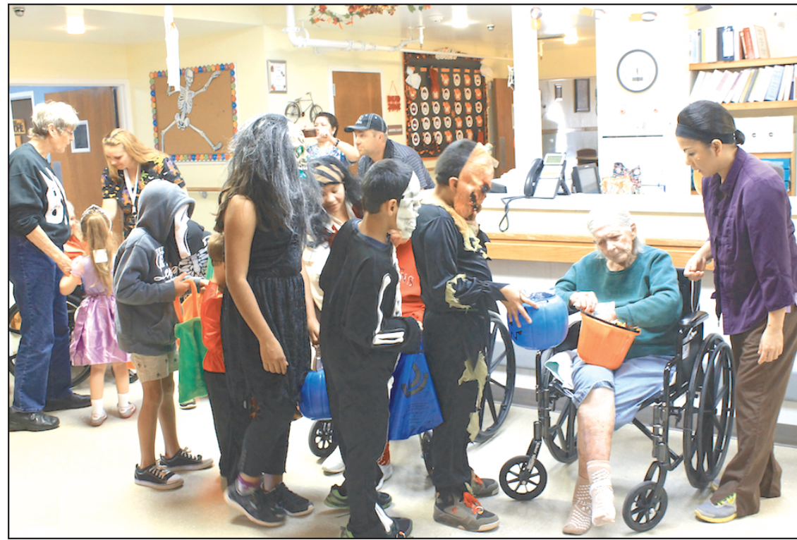
BHRC Host Children! Residents of Bronte Health & Rehab Center greeted the children who came to the Halloween Celebration for "Trick or Treating".