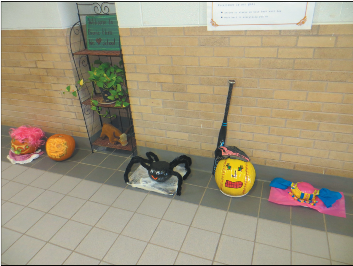
Pumpkin Decorating Contest! Students at Bronte Elementary School had the opportunity to participate in the annual Pumpkin Decorating Contest. There were over 40 pumpkins entered and some of the awards included Scariest Pumpkin, Best Carved Pumpkin, Best of Show, Grand Prize and 1st, 2nd and 3rd place. Some of the decorated pumpkins are pictured above. In addition to the decorating contest, all of the elementary students who dressed up had the opportunity to join in the Costume Parade and walk across the stage in the auditorium. A spooky time was had by all.