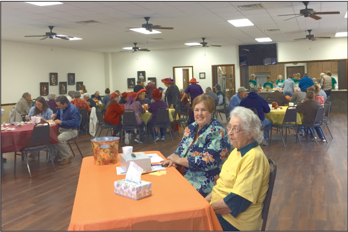
Potato Bake! The Sorosis Study Club hosted their annual Potato Bake Luncheon on Tuesday, November 7, at the First Baptist Church in Bronte. Those in attendance enjoyed baked potatoes and all of the fixings, as well as a wide variety of casseroles and salads.

Per Year in Coke County ... $30.00 Per Year Elsewhere in Texas ... $35.00 Per Year Outside of Texas ... $37.00