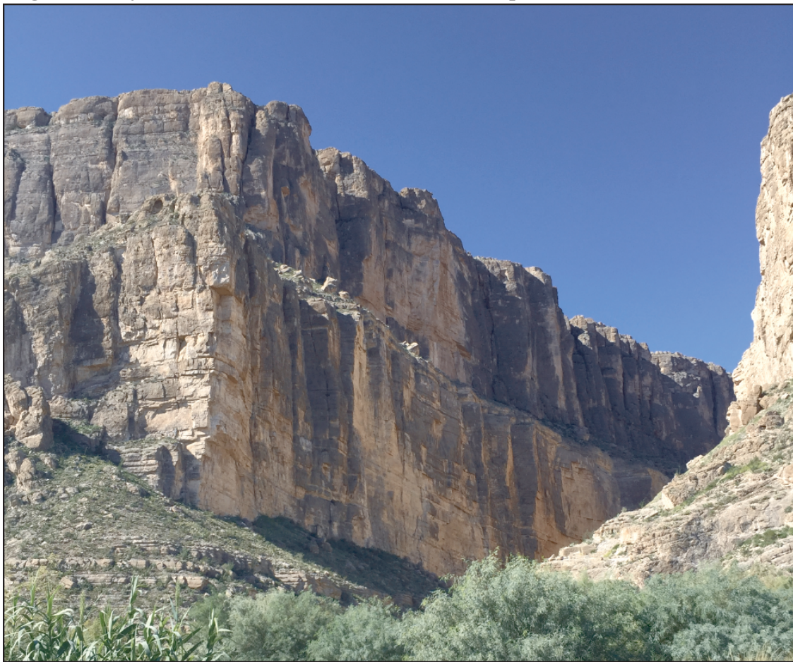
Santa Elena Canyon - Big Bend National Park