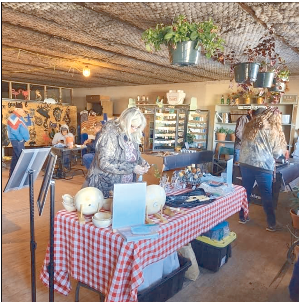
Fall Market! A 'Falling into Christmas' Fall Market was held on Saturday, November 12, at Coke County Feed and Ranch Supply in Robert Lee. There were many vendors selling their goods both inside the store and outside.