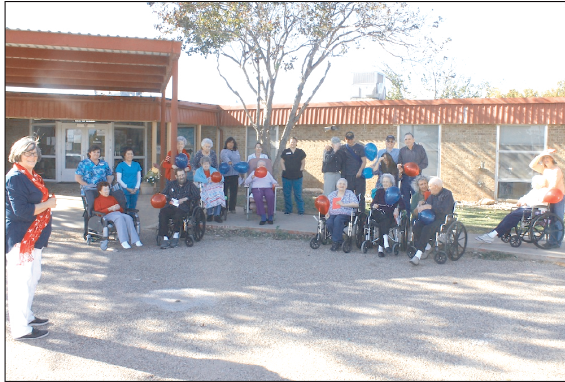
BHRC Veterans Celebrated! Veterans at Bronte Health and Rehab Center were honored with a celebration Wednesday, November 11, on Veterans Day.

Local and area businesses will also have booths available. For more information contact the Sterling County Extension Office at (325) 378-3181.