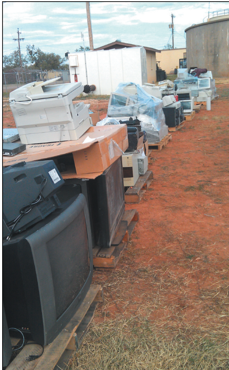
Electronics Recycling! Eleven pallets of electronics were collected last Saturday in Bronte for recycling.

The agency also administers a water supply enhancement program through the targeted control of water-depleting brush. The TSSWCB also acts to ensure that the State’s network of 2,000 flood control dams are protecting lives and property by providing operation, maintenance, and structural repair grants to local government sponsors and facilitates the Texas Invasive Species Coordinating Committee.