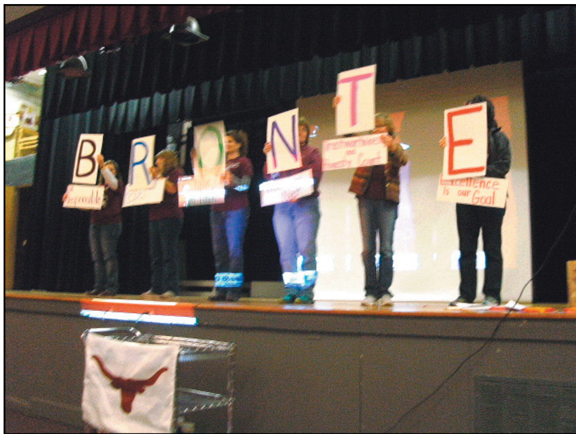
Academic Pep Rally! Bronte Elementary School recently hosted a second six weeks Honor Roll Pep Rally to acknowledge and honor all the students who made "A" Honor Roll and "A/B" Honor Roll. Prizes were also awarded for Perfect Attendance and Citizenship. Several elementary teachers are pictured holding up the letters B-R-O-N-T-E. These letters represent the Bronte Elementary School expectations: B-be responsible, R-respect, O-on time and on task, N-nice and neat, T-trustworthiness and honesty count, E-excellence is our goal.