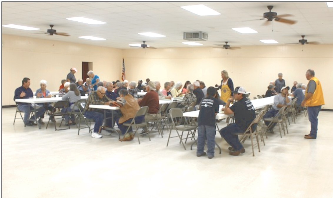
Pancake Supper! The Robert Lee/Silver Lions Club held their annual Pancake Supper and Cake Auction Saturday, November 11, 2017, at the Rec Hall in Robert Lee. This year, they were assisted by members of the Coke County 4-H program. Proceeds from this year's event will benefit the '64 Study Club and the Coke County 4-H program.

Per Year in Coke County ... $30.00 Per Year Elsewhere in Texas ... $35.00 Per Year Outside of Texas ... $37.00