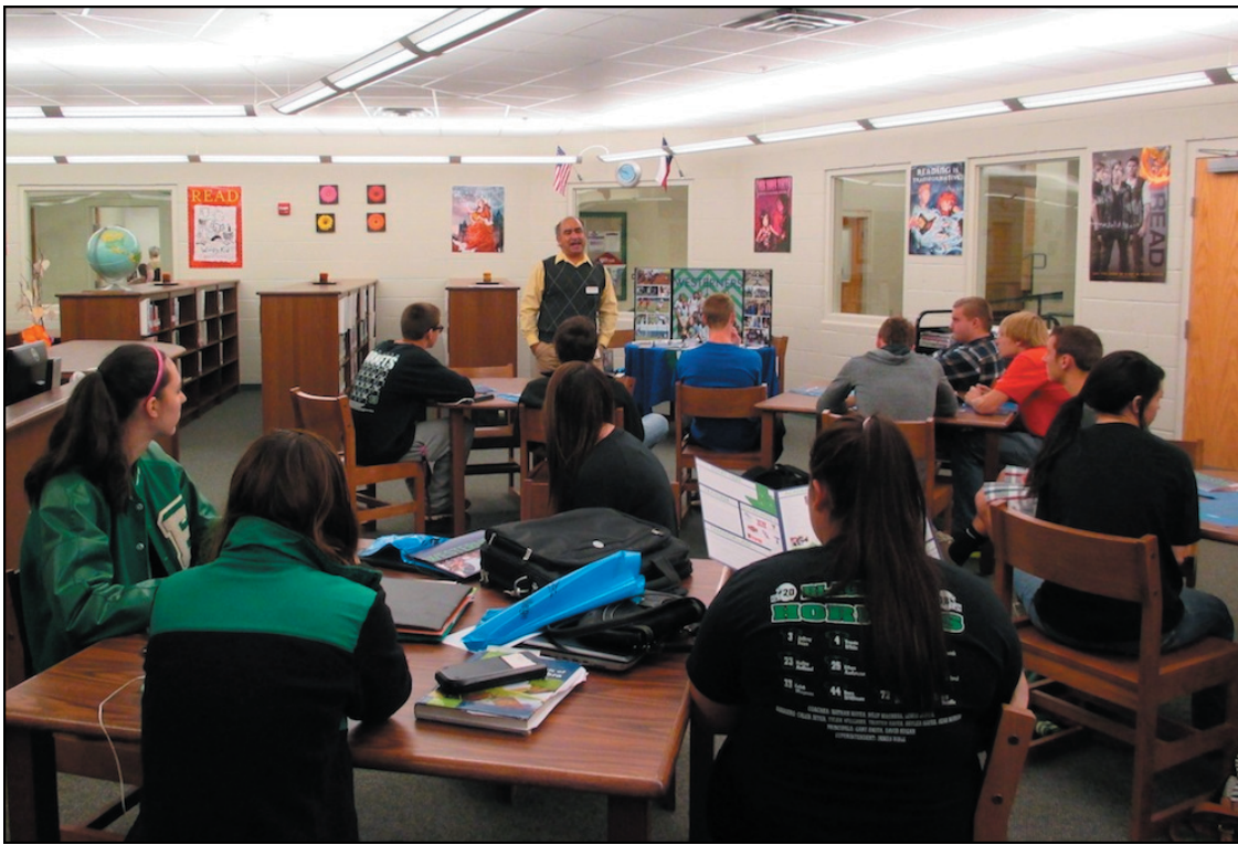
WTC Presentation! A representative from Western Texas College in Snyder recently spoke to seniors at Blackwell High School about the educational programs the college offers, including degrees and certificate programs. He also discussed financial aid opportunities, admission requirements and testing, as well as current trends in the job market. Students had the opportunity to ask questions and pick up brochures.