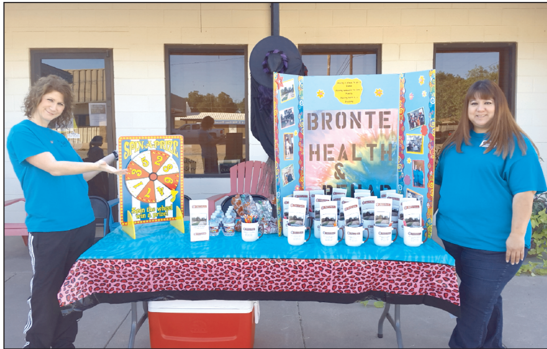
BHRC at Bronteoberfest! Bronte Health & Rehab Center had a booth in downtown Bronte offering prizes for "Spinning Your Number" at Bronteoberfest on Saturday, October 22, 2016.

Per Year in Coke County ... $30.00 Per Year Elsewhere in Texas ... $35.00 Per Year Outside of Texas ... $37.00