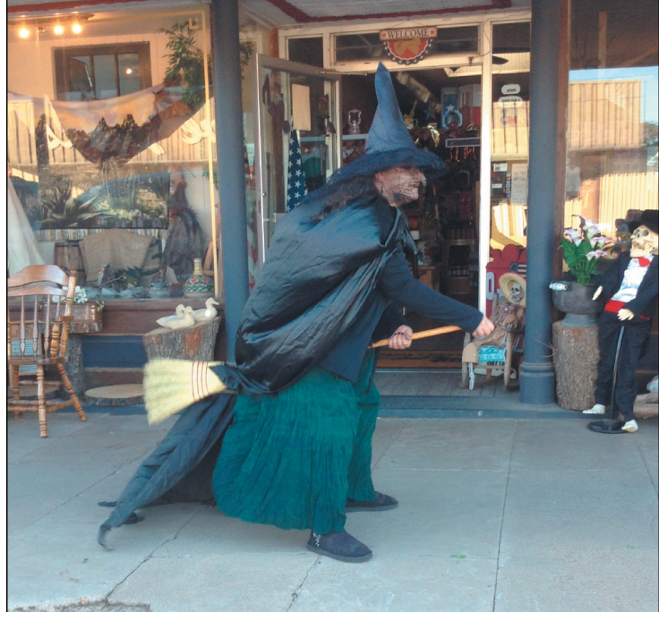
This scary old witch flew into Bronte for Halloween. She took up residence at Bronte General Store for the day.

The annual Veterans Day Program, sponsored by the Robert Lee Independent School District, will be held Monday, November 11, at 9:30 am in the school cafetorium. The program will include patriotic speeches,