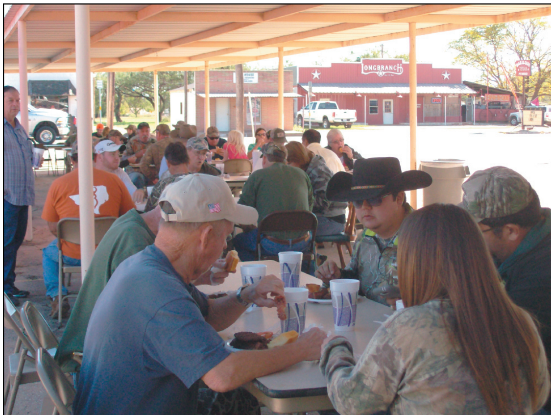
B&K Hunters Barbecue! A large lunch crowd enjoyed the good food last Saturday at the Hunters Barbecue sponsored by B&K Deer Processing in Bronte.