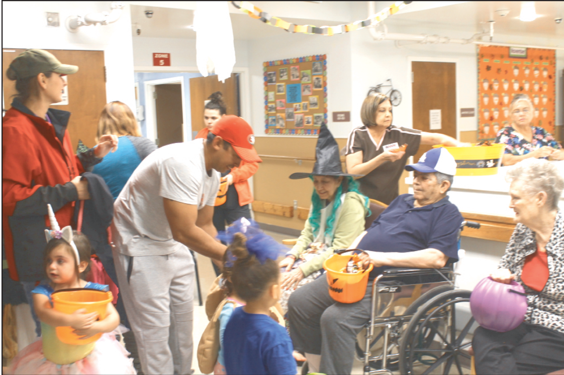
Treats! Residents at the Bronte Health and Rehab Center enjoyed handing out candy and treats to local children for Halloween.

Crafts - Includes paper crafts, wood crafts, and decorative items. The possibilities are