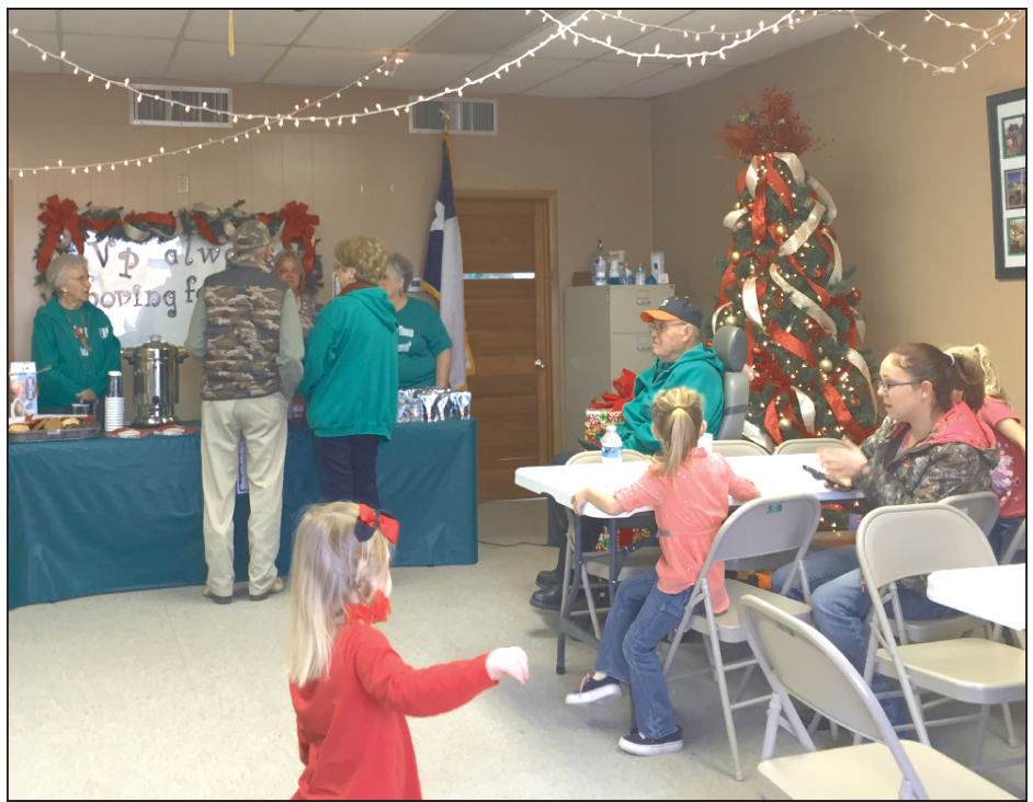
Christmas Festivities in Robert Lee! The Christmas season began in Robert Lee last Friday with Open Houses in numerous businesses and offices downtown. A tasty array of holiday snacks (left) was available in the Commissioners Courtroom in the Coke County Courthouse for attendees at this year's open house. Delicious chili and stew were among the warming foods available Saturday evening at Vision with a Purpose's Christmas headquarters during A Small Town Christmas.