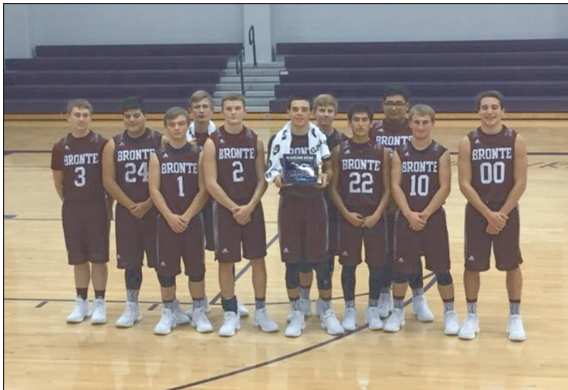
Champions! The Bronte High School Longhorns basketball team was recently named champions of the Roscoe tournament after winning all five of their games.

The Longhorns also defeated Christoval 68 - 59 recently during a regular season game.