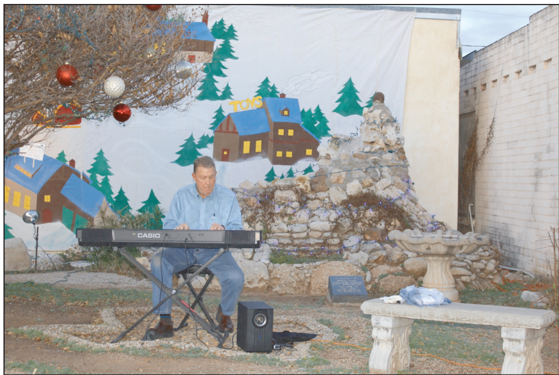
Small Town Christmas December 5, 2015, in Robert Lee