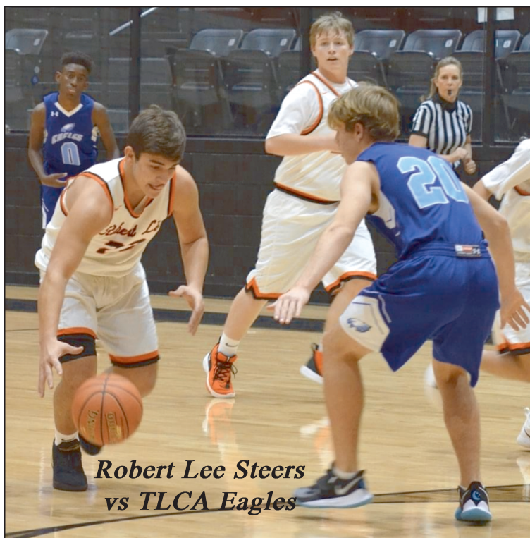
Robert Lee Steers vs TLCA Eagles