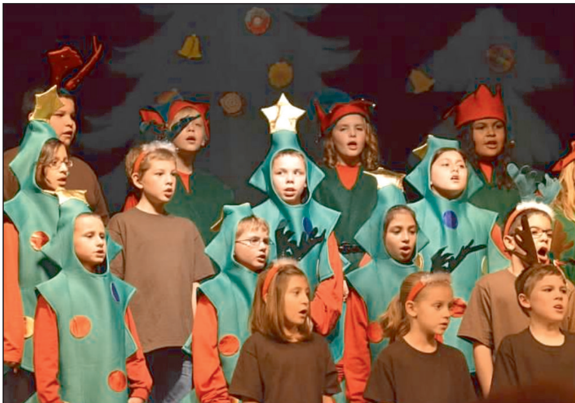
Robert Lee Elementary Christmas Music Program