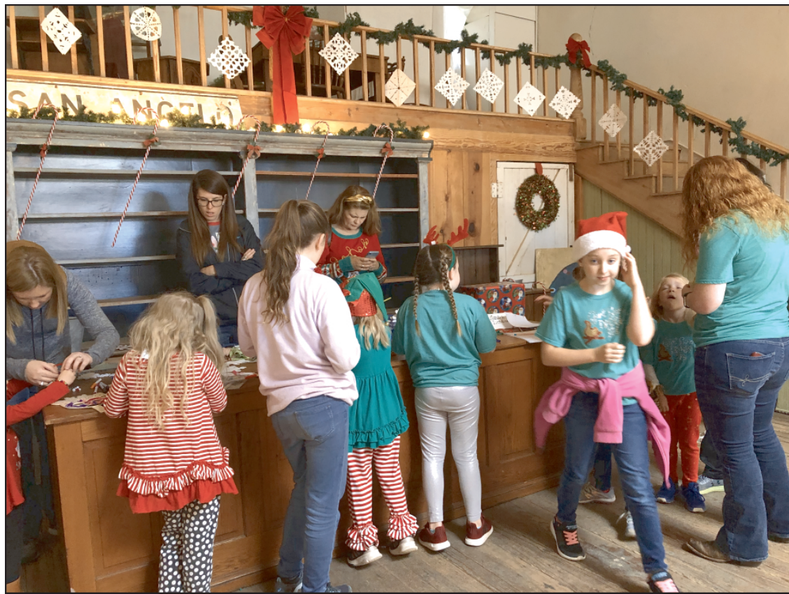
Christmas in Olde Bronte

10 And the angel said unto them, Fear not: for, behold, I