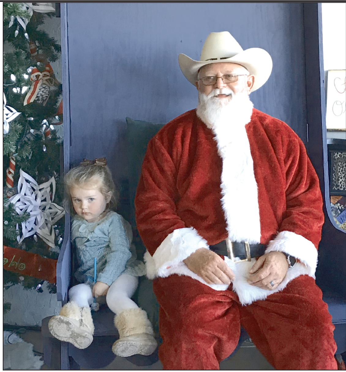
Not Sure About Santa! This little cutie wasn't sure if Santa was friend or foe during Christmas in Olde Bronte Saturday afternoon, December 15, 2018.

Serving will be from 11 am to 1 pm in the small lobby located at